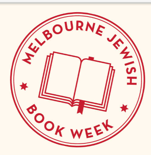
We love to talk books in a city that loves to read them