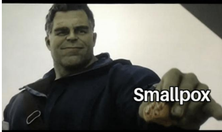
(Pre-Coloubian- Unit 1&2)

WIFI: *drops by one bar* Youtube video quality: