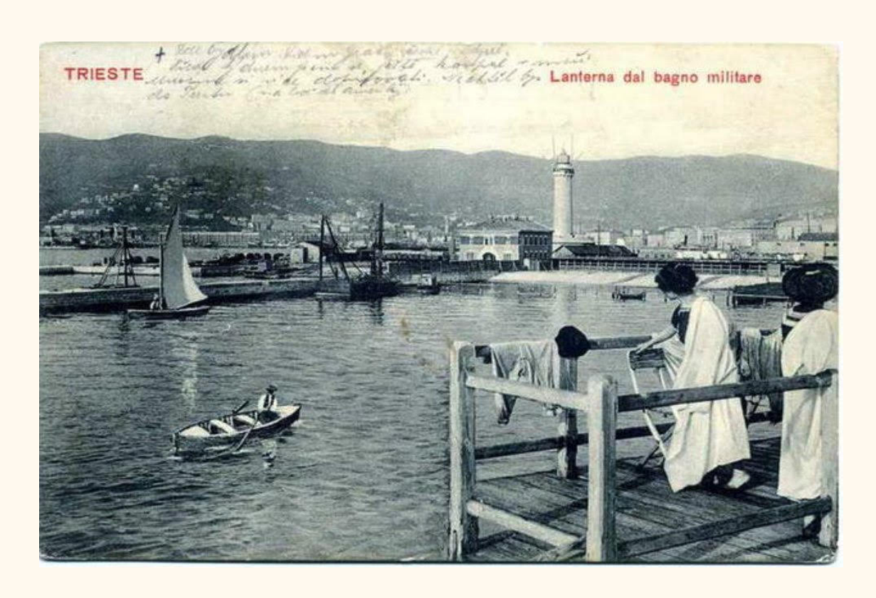
To find out the significance of this photograph, you will have to read The Ratline .