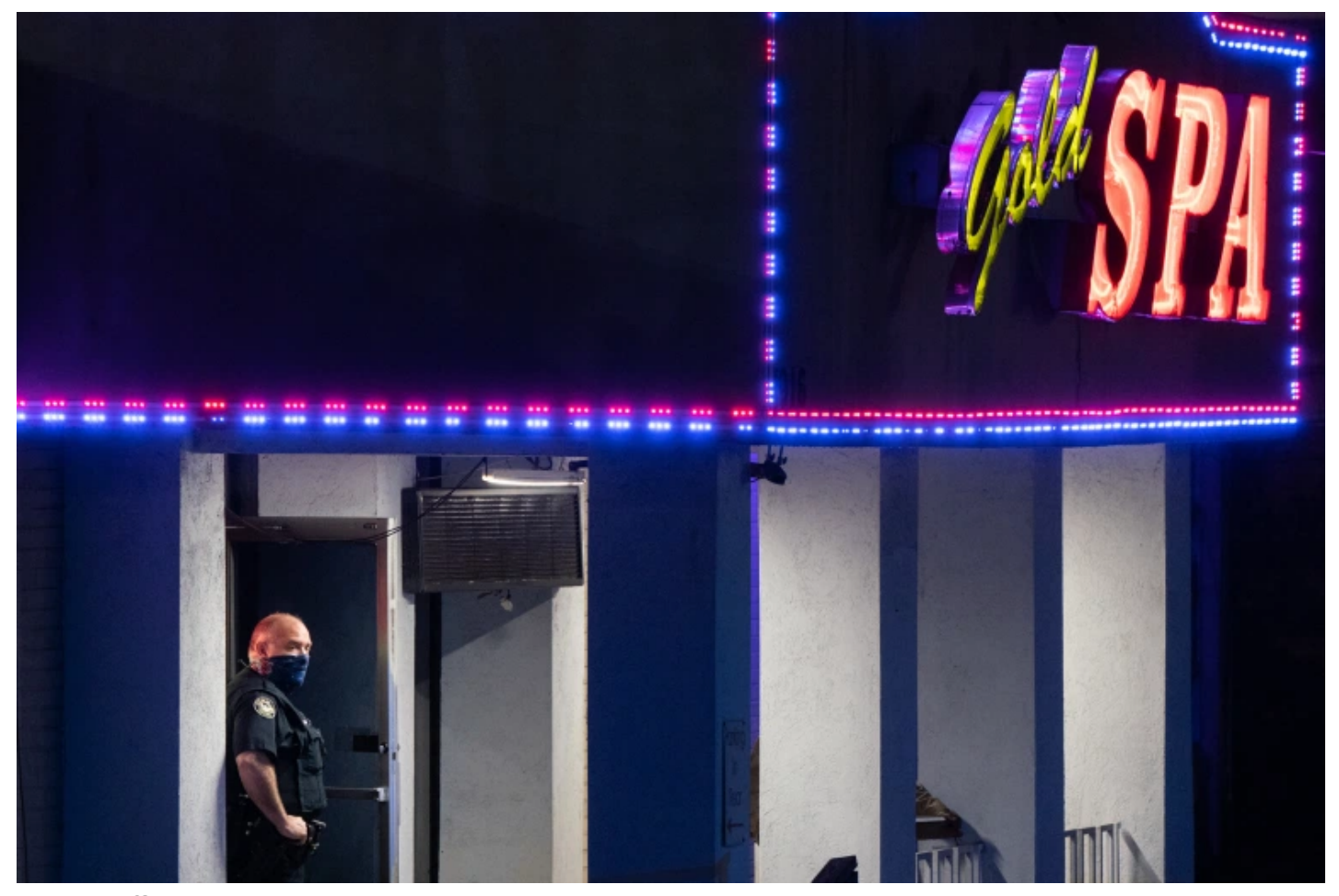
A police officer stands outside a massage parlour where three people were shot and killed on March 16, 2021, in Atlanta, Georgia

The New York police department's counterterrorism bureau said it was "monitoring the shooting of Asian Americans in Georgia" and deploying officers "to our great Asian communities across the city out of an abundance of caution", though it added there was no known link to the city.