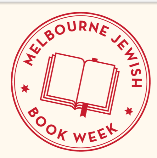
We love to talk books in a city that loves to read them