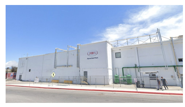
The JBS meatprocessing plant in Hyrum. An outbreak of the coronavirus has been linked to the plant in early June.

One JBS employee, who declined to be identified for fear of reprisal, said in a phone interview earlier Tuesday that her entire household of six people has tested positive for COVID-19 and is battling the symptoms. She and her husband, who are from Mexico and speak limited English, both work at the plant.