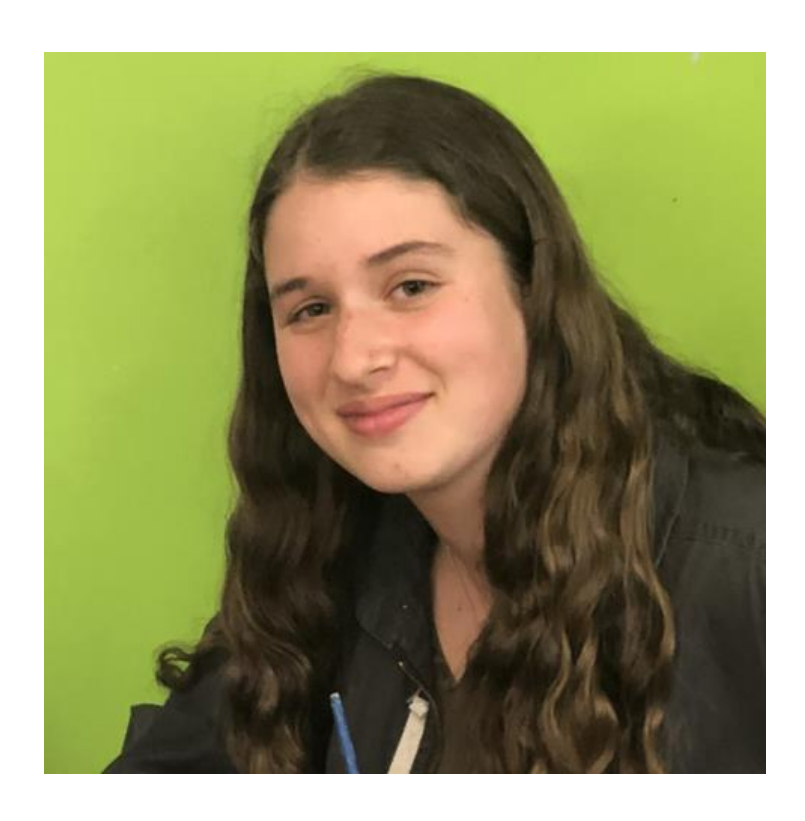
"The Jam Project equipped me with a tool belt of skills that I could use in the future -