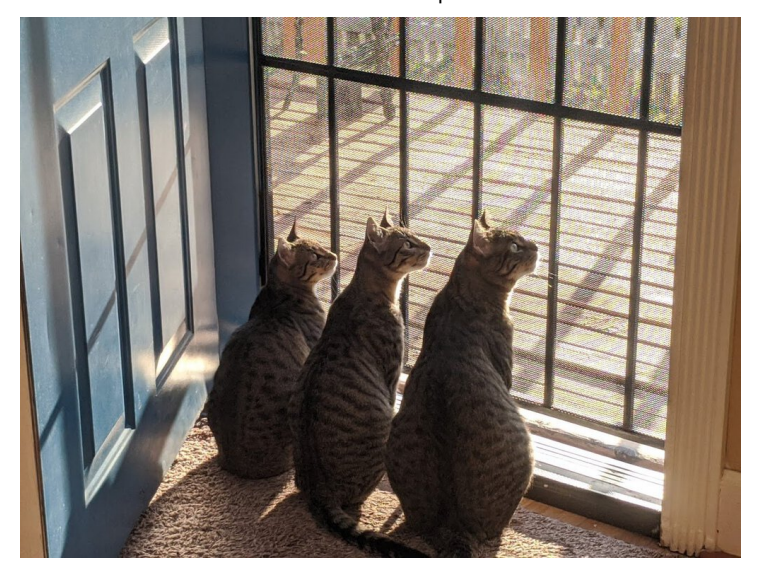
From left: Sable, Miko and Mikey.

"Mikey (right) is a rescue from West Seattle. Miko (middle) and Sable (left) are twins that we rescued from Texas, a high kill state.