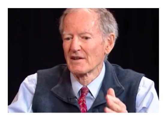
America's #1 Futurist Issues Warning Internet Reboot 2020