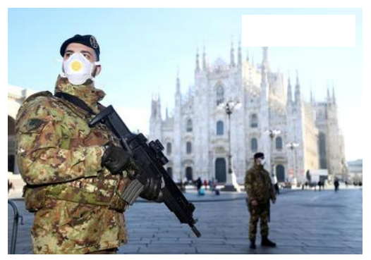
Exclusive - 'Things under control': how Europe sleepwalked into the... 02 Apr