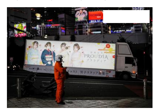
Japan 'on the brink' as it struggles to hold back coronavirus 01 Apr