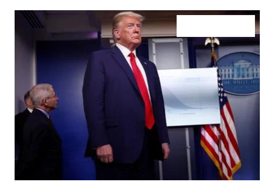
Trump warns Americans of a tough two weeks ahead in coronavirus fight O1 Apr