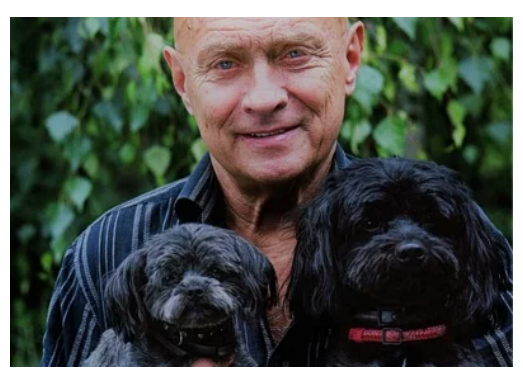
Motley Fool Issues Rare "All In" Buy Alert The Motley Fool