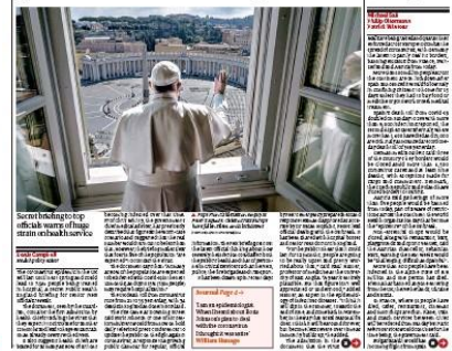
Europe puts 100m on lockdown as toll grows