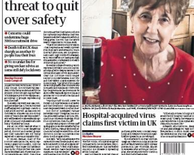
Hospital-acquired virus claims first victim in UK