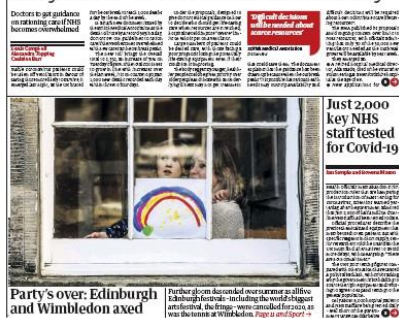
Party's over: Edinburgh and Wimbledon axed