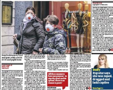
Hotel lockdown in Italy and Spain, with a third of the UK and parts of France