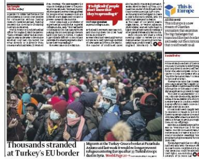
Thousands stranded at Turkey's EU border