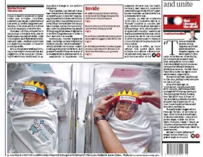
COVID-19 The power to destroy and unite