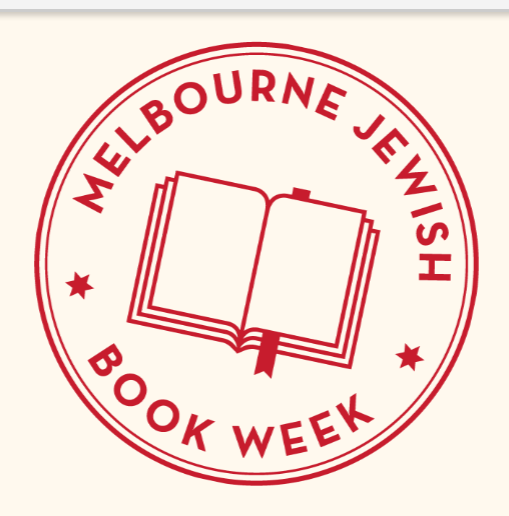
We love to talk books in a city that loves to read them