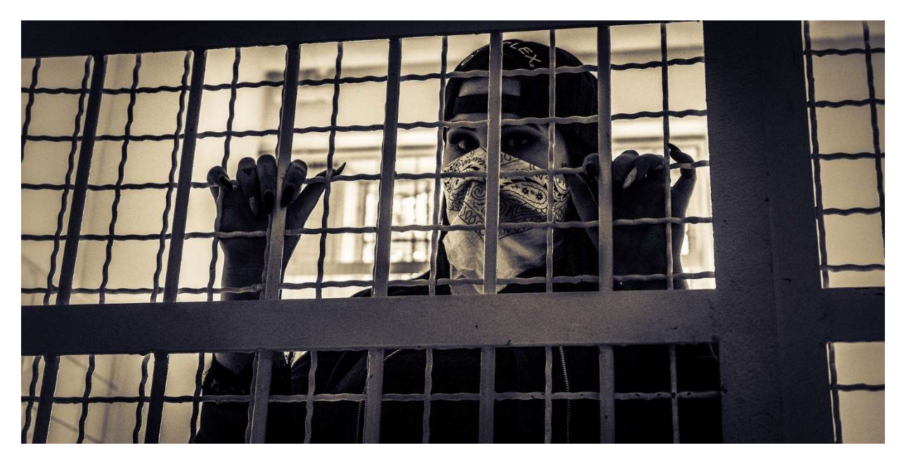
Caption: Masks have been proven to slow the spread of Covid-19 but in correctional facilities they can pose a safety risk because they obscure identity.