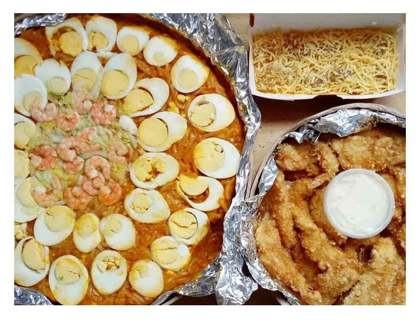
Figure 3 Because of the risks of going outside, I ordered in food for lunch as part of our celebration at home. Ordering food has already been a thing for so long, but I think this pandemic really increased the demand for such.