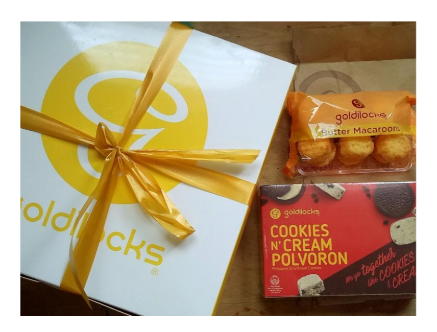
Figure 2 My boyfriend, who was residing in Cavite, had these delivered to me in Pasay via a third-party food delivery company.

The way families celebrated the graduating students' milestones also changed. Before, others would dine out for lunch or dinner after the ceremony. However, at this time of the pandemic, many just ordered in food to celebrate, which is what I did.