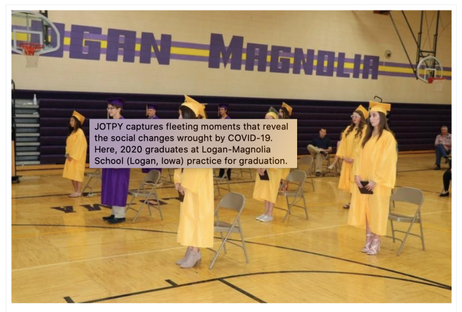
JOTPY captures fleeting moments that reveal the social changes wrought by COVID-19. Here, 2020 graduates at Logan-Magnolia School (Logan, Iowa) practice for graduation.

have been and continue to be especially hard-hit by the virus. Longtime community partners now face furloughs and empty grant coffers, and casual community events that might have led to new partnerships have been canceled. Historians and archivists face an ethical quandary as a result. It is insensitive to ask suffering strangers to spend their time and emotional resources contributing to an archive. It's also wrong not to try.