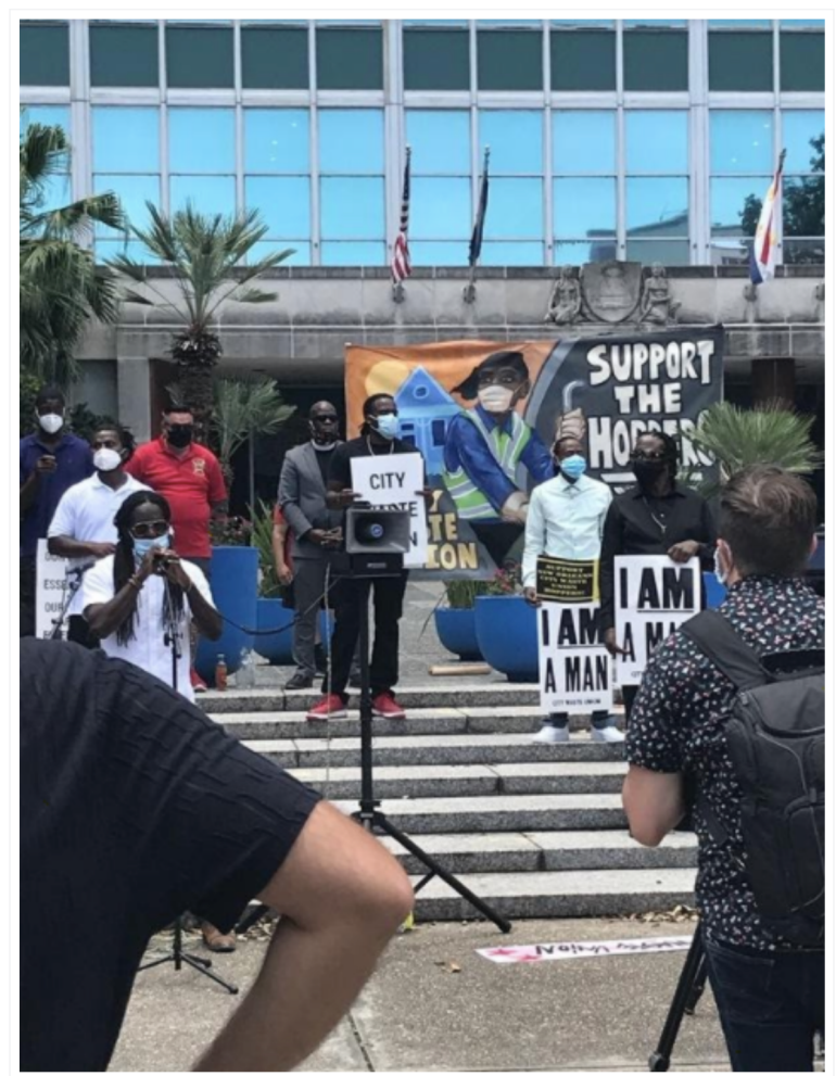
JOTPY highlights ongoing silences and the challenging imperative to correct them. The workers hosting a socially distanced press conference here are from the New Orleans City Waste Union.

We also invite you to teach the archive. JOTPY offers a rare opportunity for both students and instructors to analyze how the historical record is formed while helping to shape it themselves. Students will be engaged in relevant, important, purposeful work that will define how we remember and understand this moment. In our attempt to lower the bar of entry, the JOTPY team is currently developing modules for educators at all levels to adapt, remix, and reuse during classes this summer and in the coming school year. These are pending, so check back often or inquire with us about new resources.