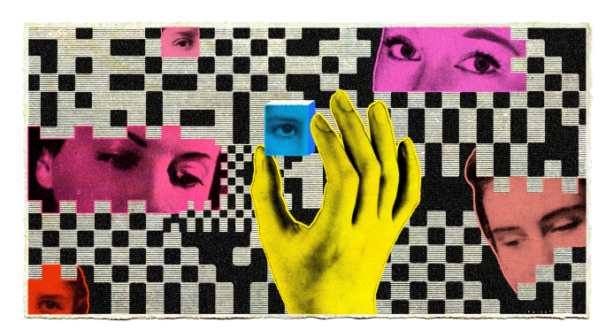
Evidence of the #MeToo movement should be preserved, both because it matters and because it could disappear. But archivists face a battery of technical and ethical questions with few precedents.

A round the height of the <u>#MeToo</u> revelations, in the fall of 2017, I interviewed an archivist at a prominent research library for a piece about social-media preservation. It quickly became apparent that he knew less about the subject than I did; he saved Facebook posts by painstakingly copying and pasting them into Word, comment by comment, and manually pressing print. The longer we spoke, the more visibly annoyed he grew by my questions, to which he offered no answers. He leaned farther and farther back in his chair and gazed over my left shoulder. Finally, he launched into a story about his senior year of college, when he wrote his thesis on an ill-defined topic and slowly realized that he'd bitten off more than he could