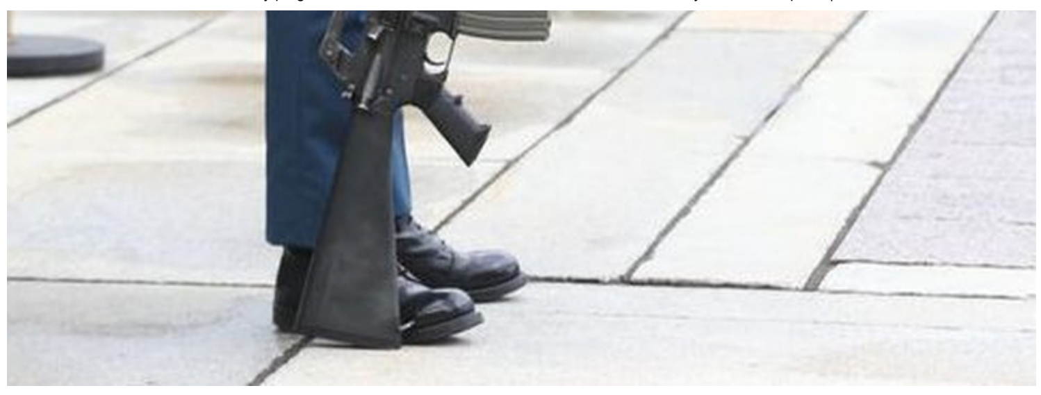
The National Sentry program started at the National War Memorial on Monday, July 13, 2020.