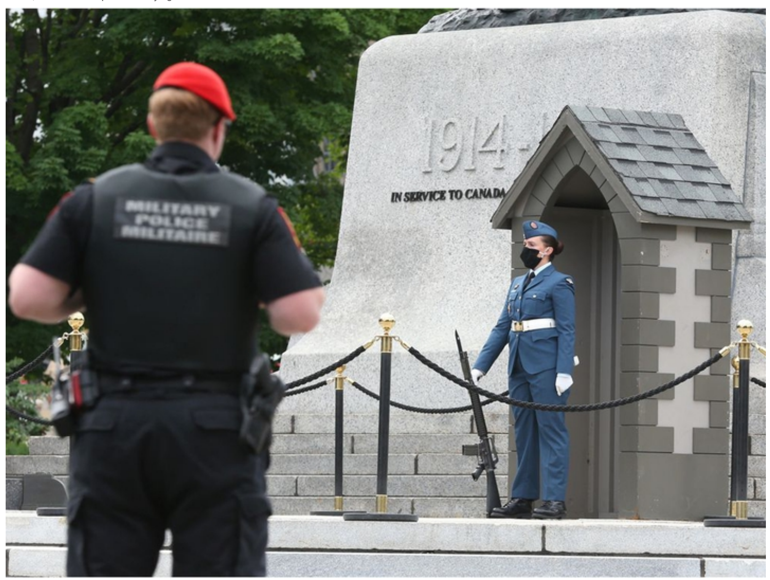
The National Sentry program started at the National War Memorial on Monday, July 13, 2020.

David Pugliese · Ottawa Citizen Jul 14, 2020 · Last Updated 1 day ago · 1 minute read