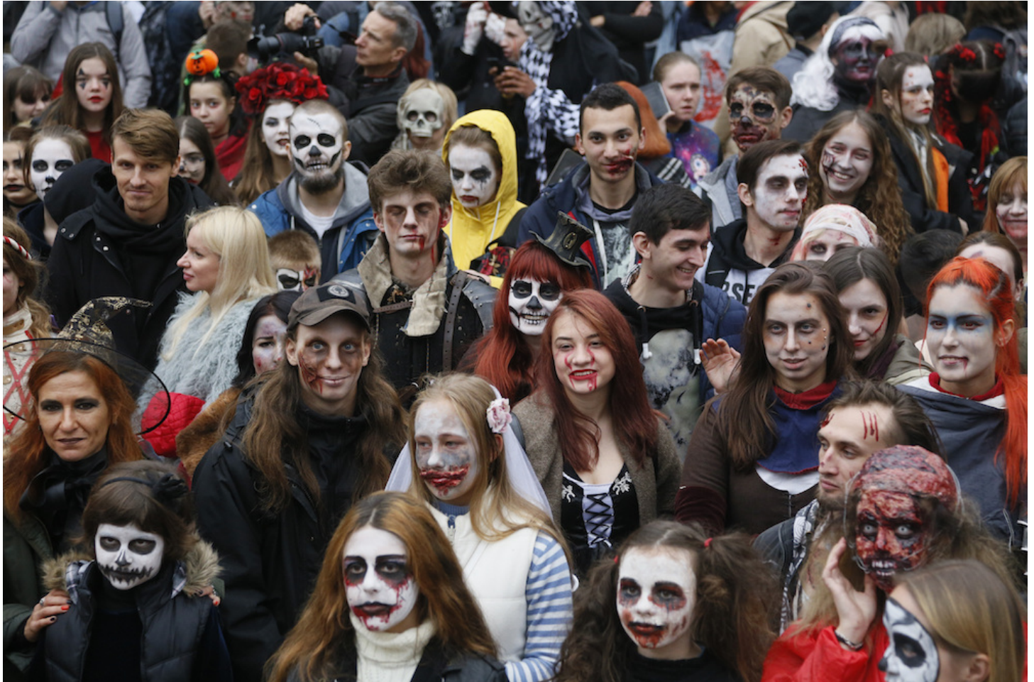
Three days before Halloween, people in Kyiv, Ukraine dress up as Zombies and participate in a 'Zombie Walk.'

Like the Living Dead, a Virus Can Overwhelm Powerful States, Ruin Economies—and Reveal Our Best and Worst Selves