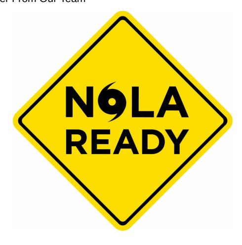
NOLA READY (Local Alerts and Info)

Your support keeps New Orleans culture ALIVE!