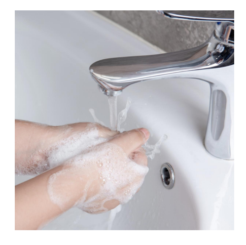
PREVENTION & TREATENT