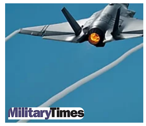
Watch this F-35 nearly plummet into the ocean during a carrier's... Military Times