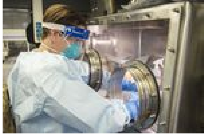
Are you a service member who survived COVID-19? Your leadership may soon be asking you to 'raise your arm'