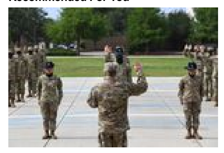
The ban on COVID-19 survivors joining up has lifted, but some cases could still be denied