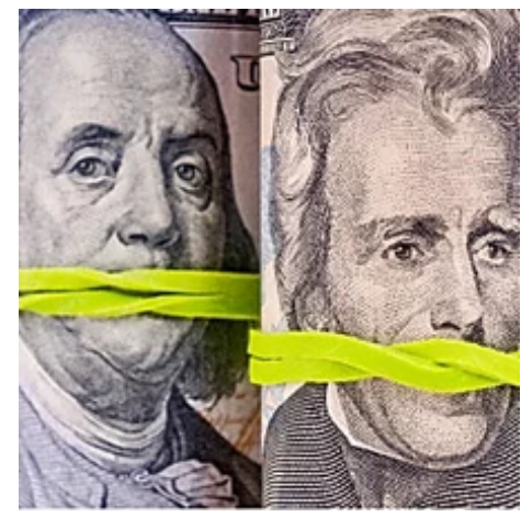
Read This Before You Renew Amazon Prime Again Wikibuy