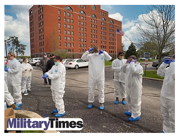
Latest National Guard COVID-19 update: Troop count at 43,300 with about 80 percent on Title 32... Military Times