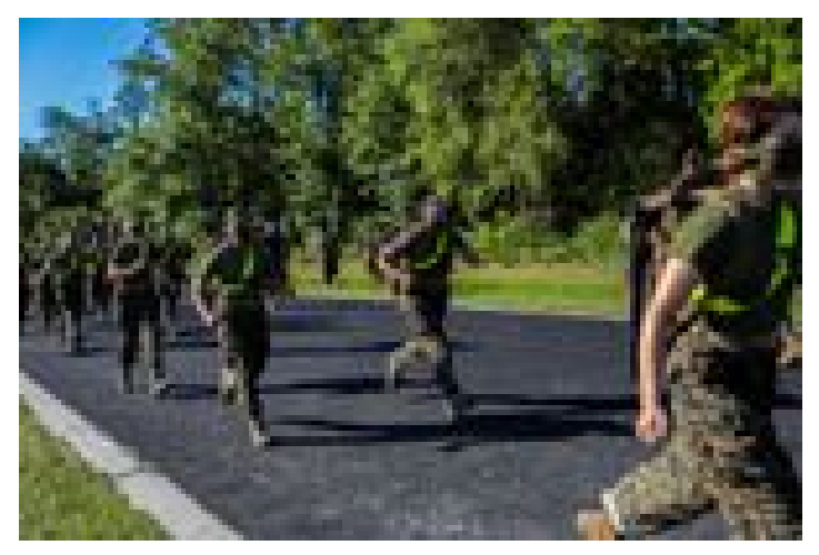
Building a better boot camp: How to make Marines during a pandemic, and beyond