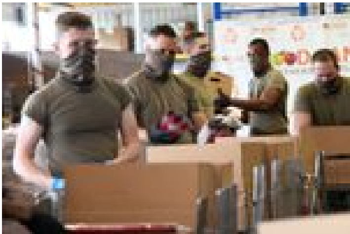
Trump extends Guard coronavirus missions until mid-August