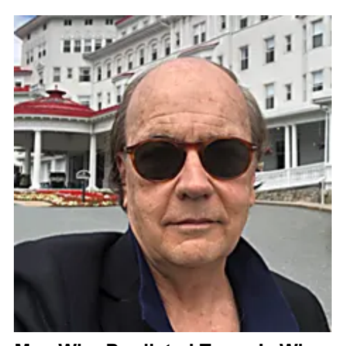
Man Who Predicted Trump's Win Makes Another Prediction betterlyfe.news