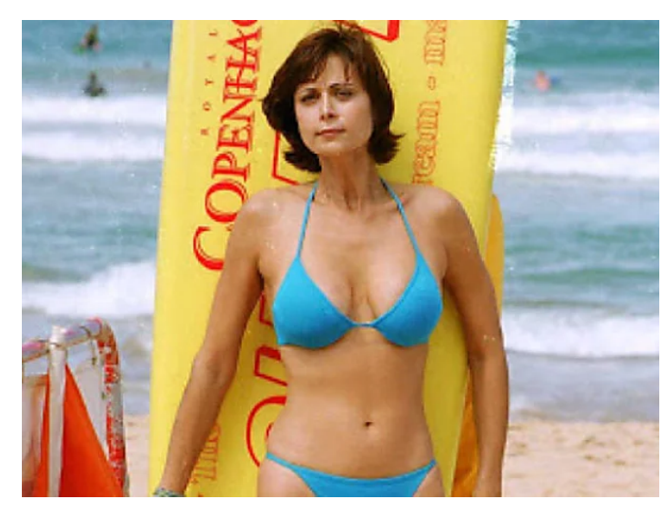
[Photos] She Never Got Married, and Now We Know Why Your Ruling Planet