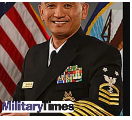
Navy fires national chief recruiter Military Times