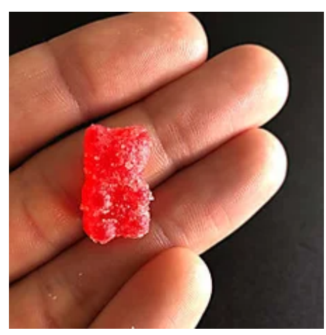
Dr: New Gummy Better Than Hemp for Pain, Anxiety, & Sleep health-repair.com