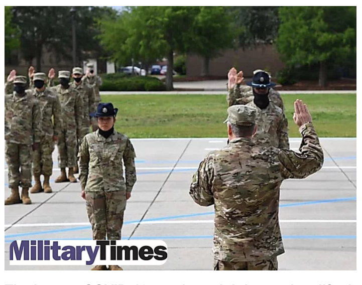
The ban on COVID-19 survivors joining up has lifted, but some cases could still be denied Military Times