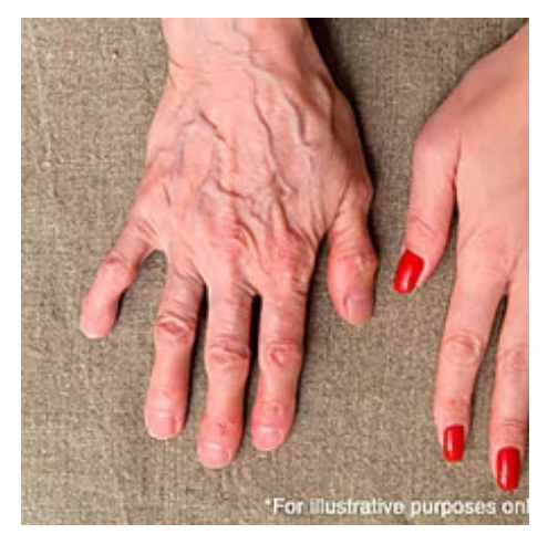
Plastic Surgeon Tells: Doing This Every Morning Can Snap Back... innerskinresearch.com