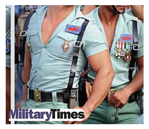
Spain deploys men in deep Vnecks and leather suspenders t... Military Times