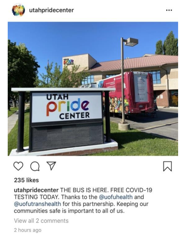
("Free Covid-19 testing at Utah Pride Center," Utah Pride Center, https://covid-19archive.org/s/archive/item/22861)

spinning for the challenges faced by the marginalized. While the pandemic in fact exacerbated many of these challenges, the LGBTQ+ community has remained steadfast and determined, and they've had the necessary experience to meet this moment with grit.