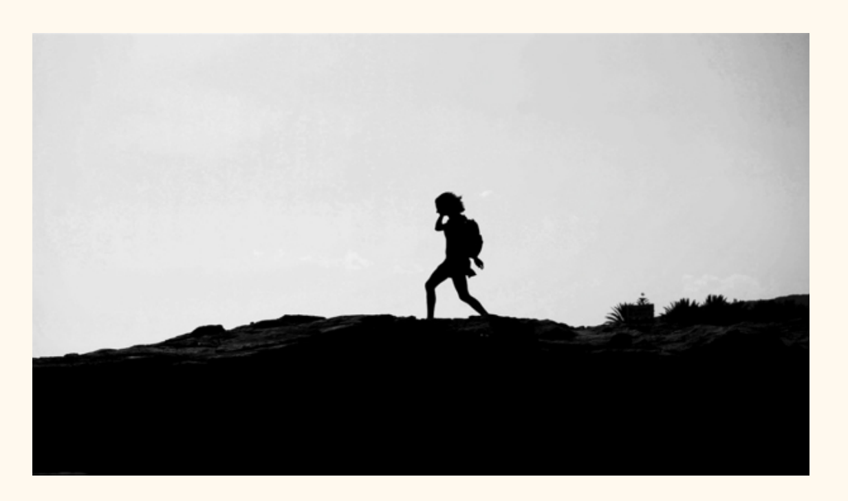
"Apeirogon - from the Greek, 'apeiron' to be boundless"