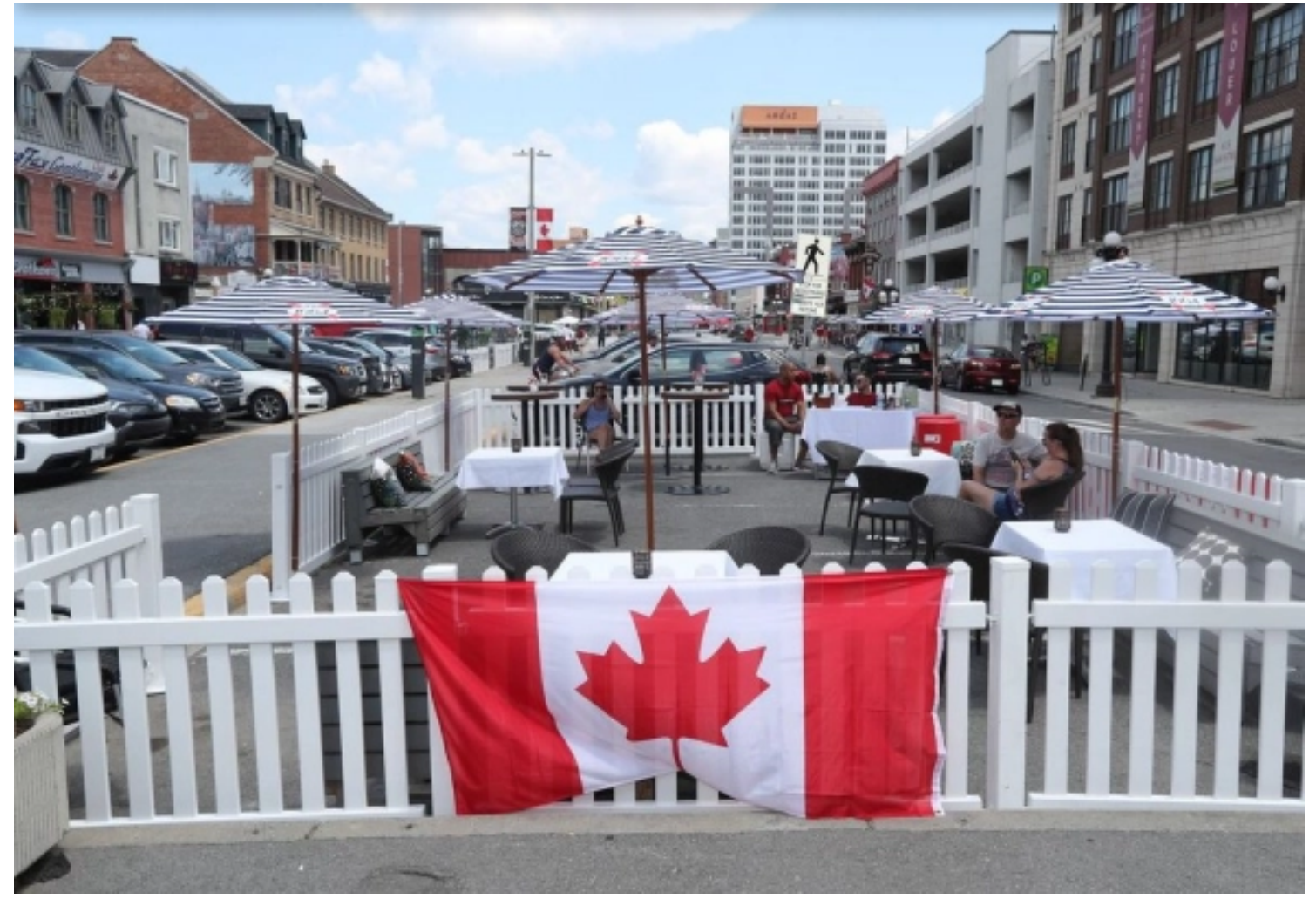
Canada Day 2020 in the Byward Market.

COVID-19 pandemic unmasks anger on Parliament Hill, picnickers elsewhere | Ottawa Citizen