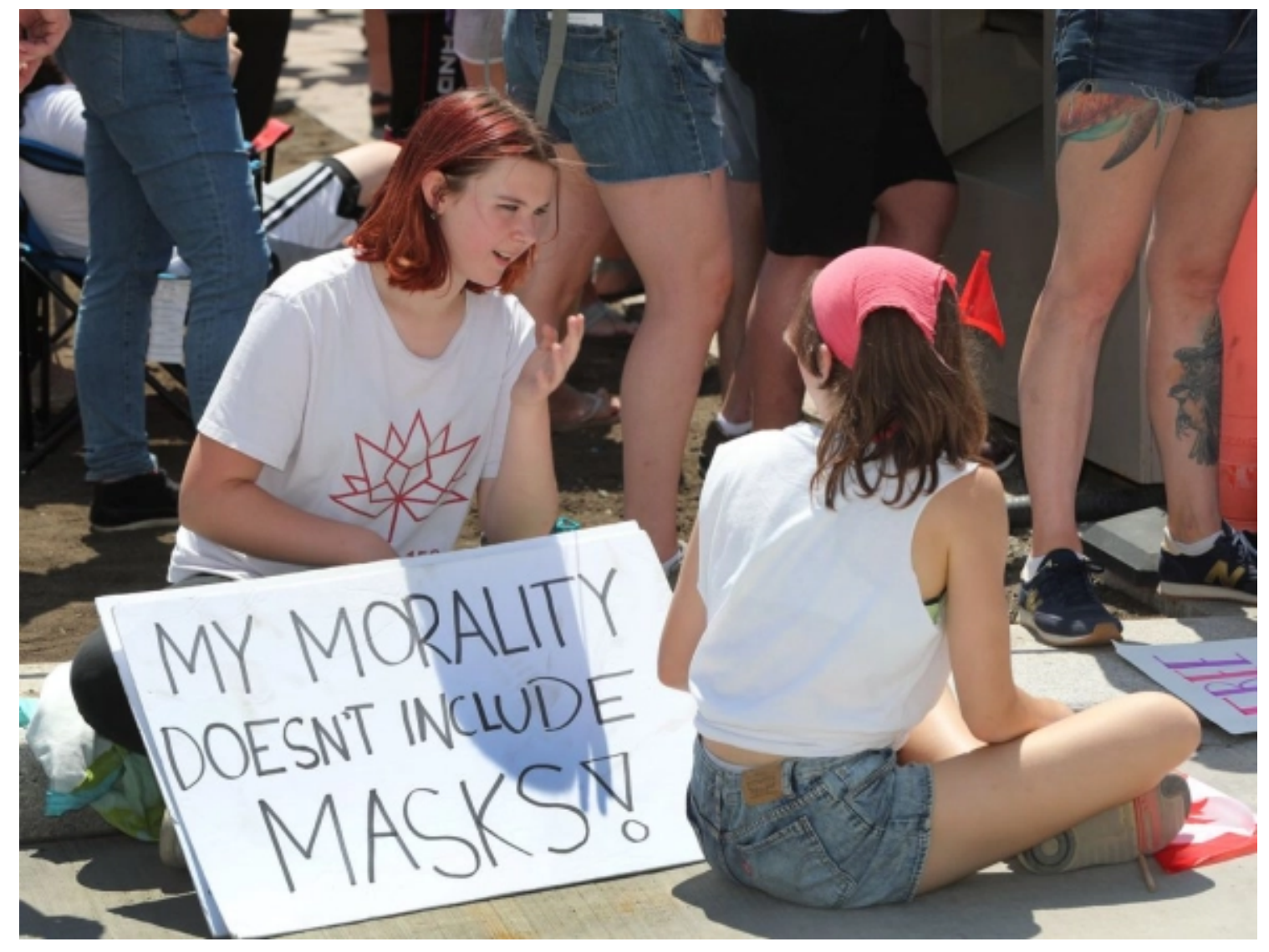
There were more protesters than Canada Day celebrations on the Hill Wednesday.