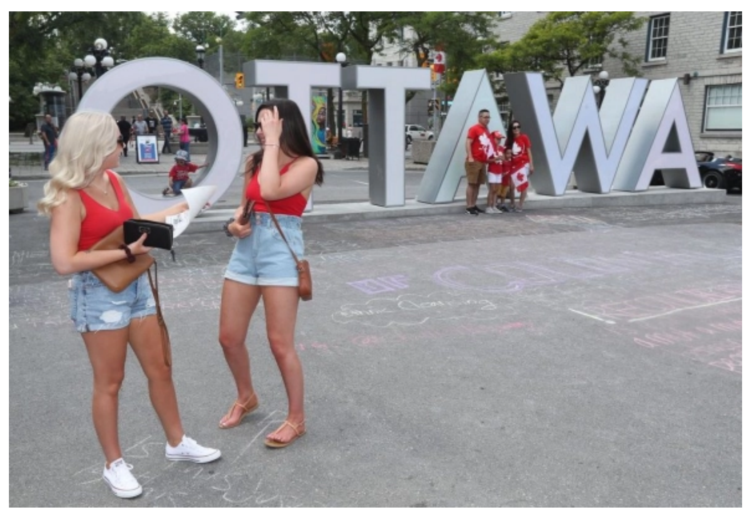
Canada Day in the Market in Ottawa on Wednesday, July 1, 2020.

OTTAWA - Canada Day on Parliament Hill in Ottawa on Wednesday, July 1, 2020.