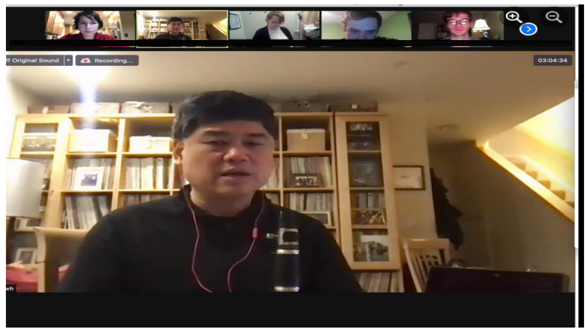
Everything was online during 2020-21, from lessons to masterclasses and more.