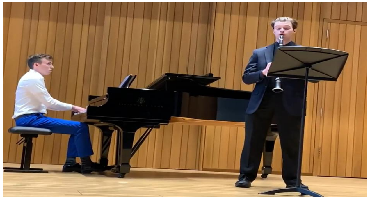
My Senior Recital a couple weeks ago. The mask mandate was finally, FINALLY lifted.