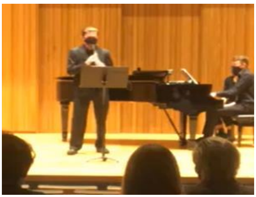
Junior Recital, playing with mask on.