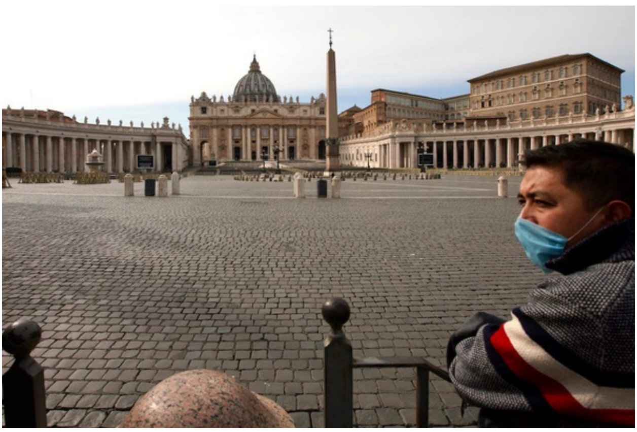
3. Yoido Full Gospel Church in Seoul is the world's largest religious congregation, with over 70, 000 parishioners: