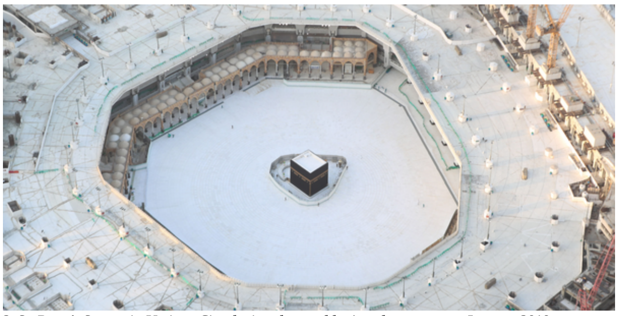
2. St. Peter's Square in Vatican City during the weekly Angelus prayer on January 2019: