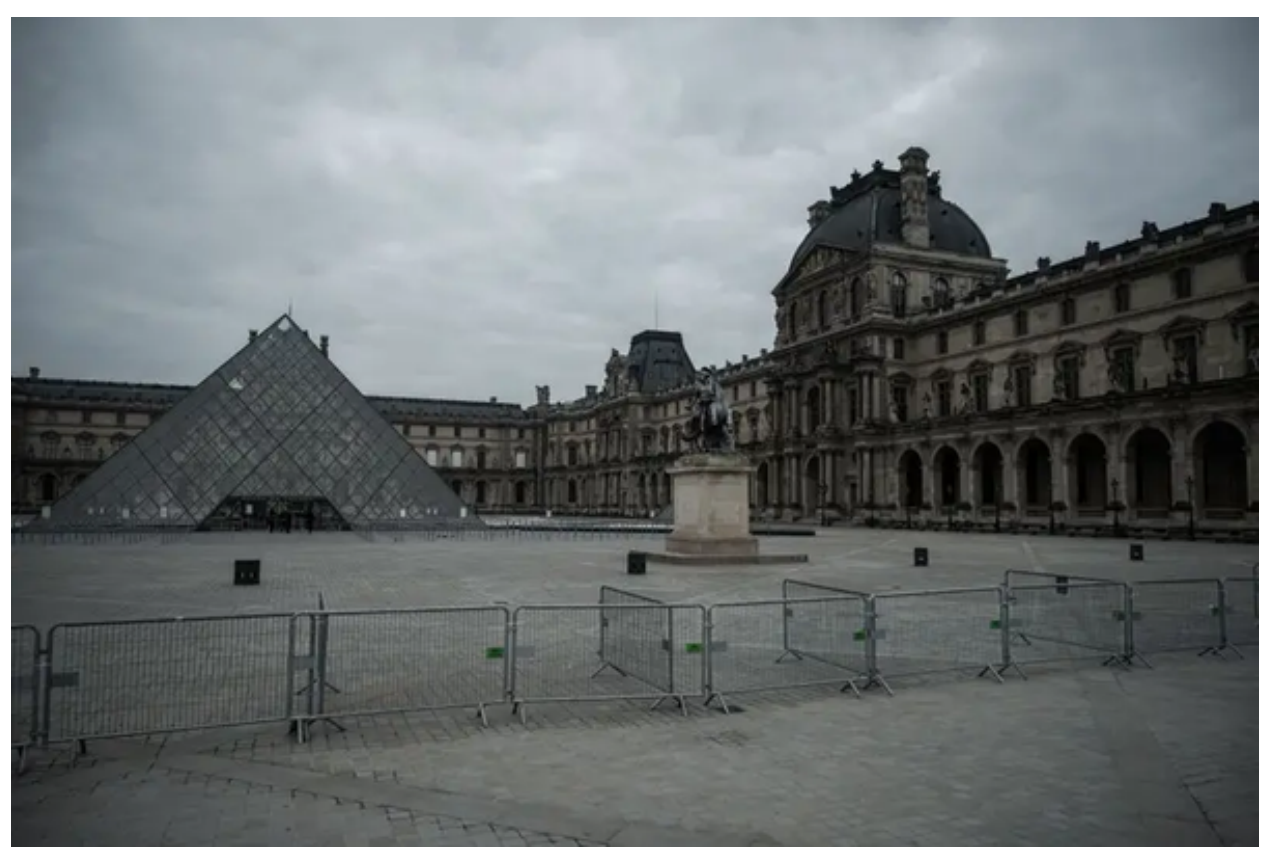
6. The Taj Mahal is one of the most famous tourist places in India.

I had visited it months before the Coronavirus . It looked like this: