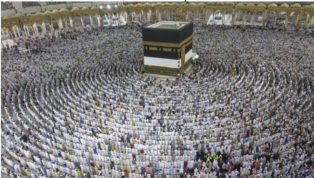
The Kaaba on March 2020:

1. The Kaaba, Islam's holiest shrine, at the Grand Mosque of Mecca in 2019: