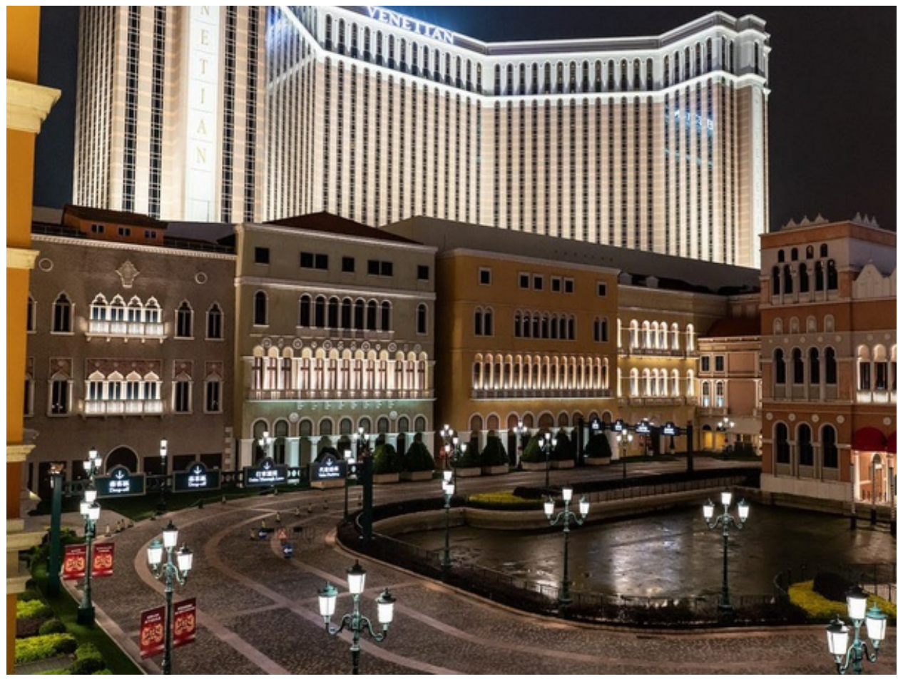
13. Before the lockdown: