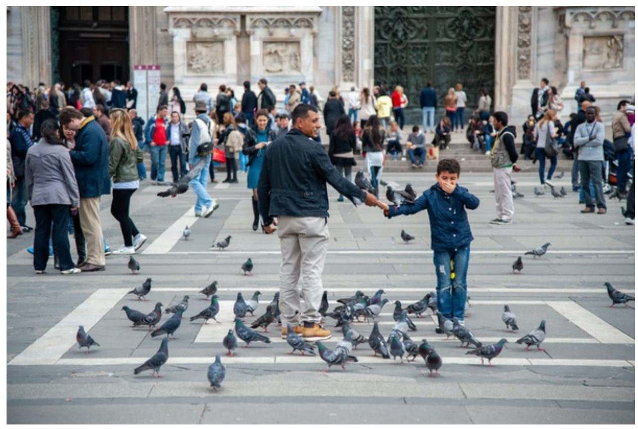
Now it remains closed: