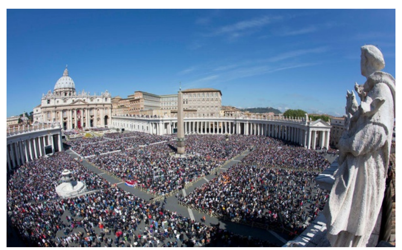
Saint Peter's Square today: