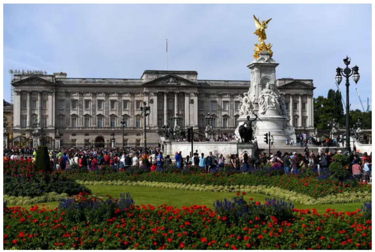
After the the lockdown has been issued: