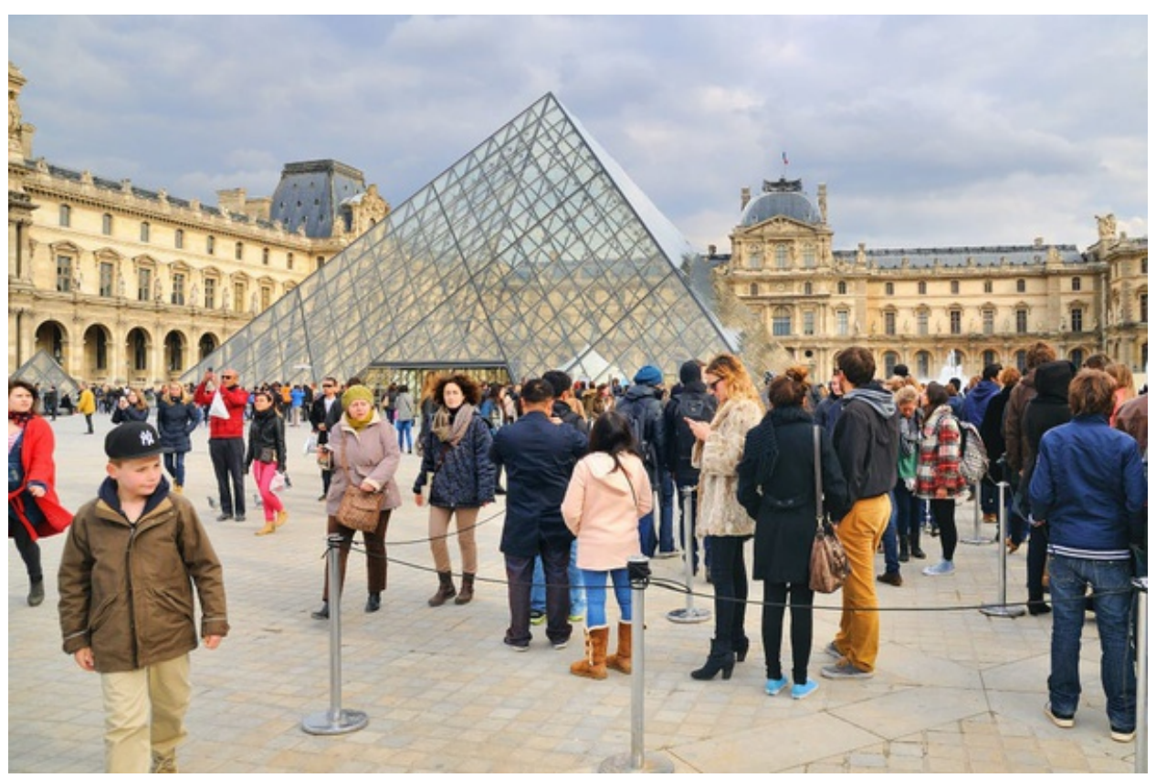
After 1st March 2020, the Museum has been closed from the public: