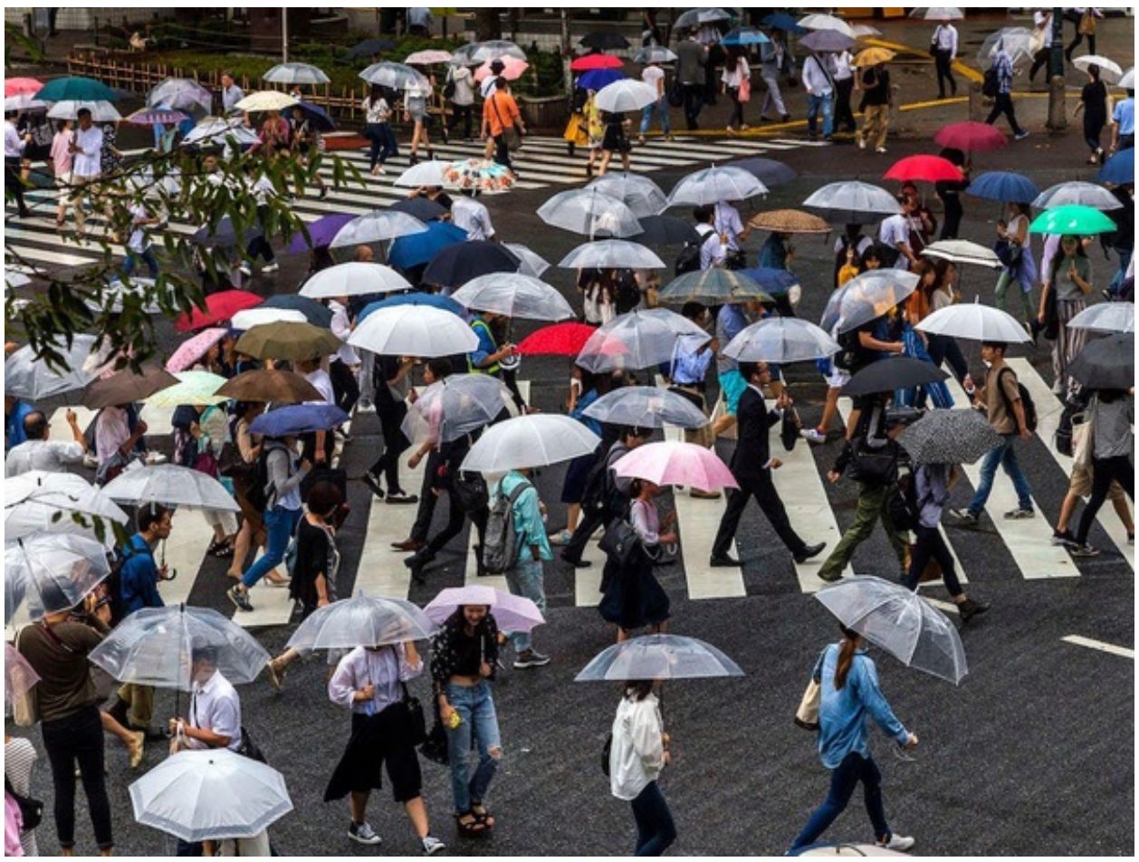
After the lockdown: