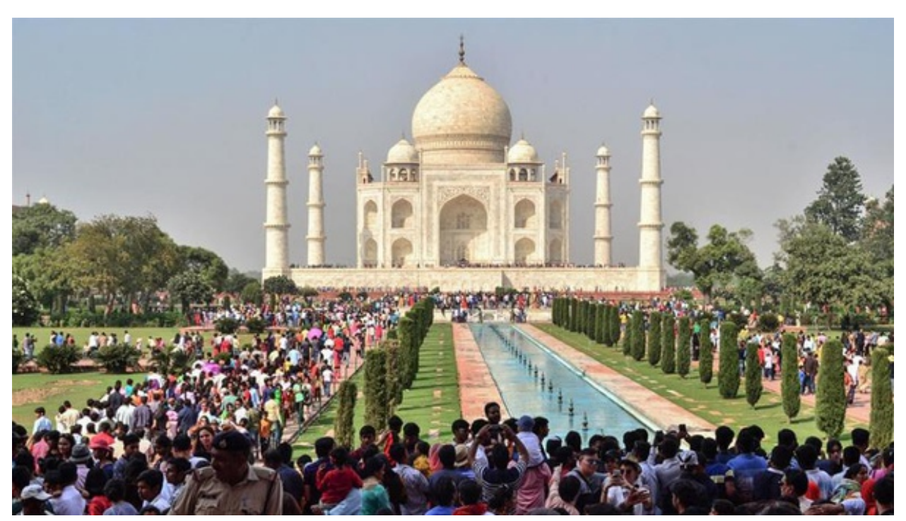
But now, the famous Taj Mahal has been closed from the public:

I had visited it months before the Coronavirus . It looked like this: