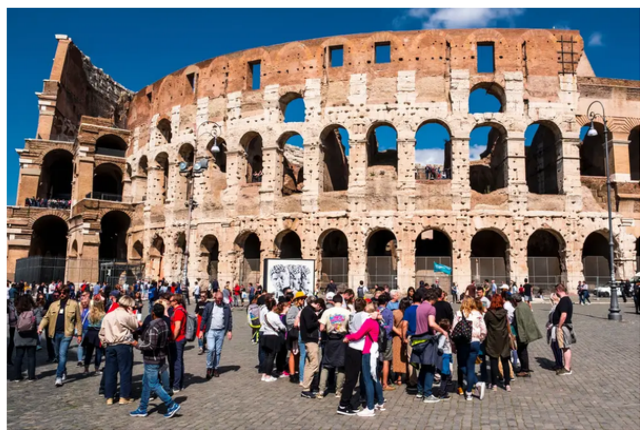
The Colosseum recently: