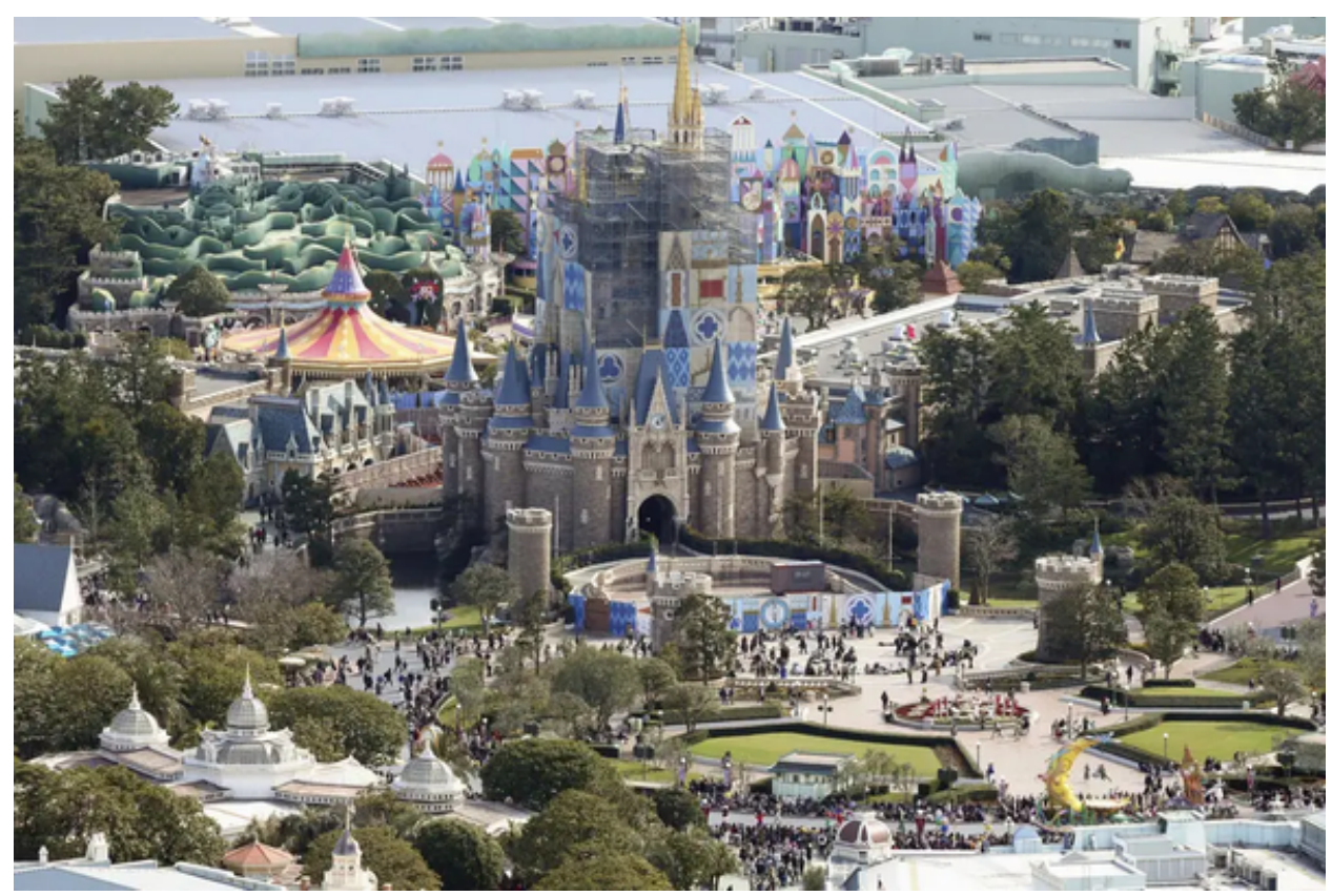
After lockdown due to Coronavirus: