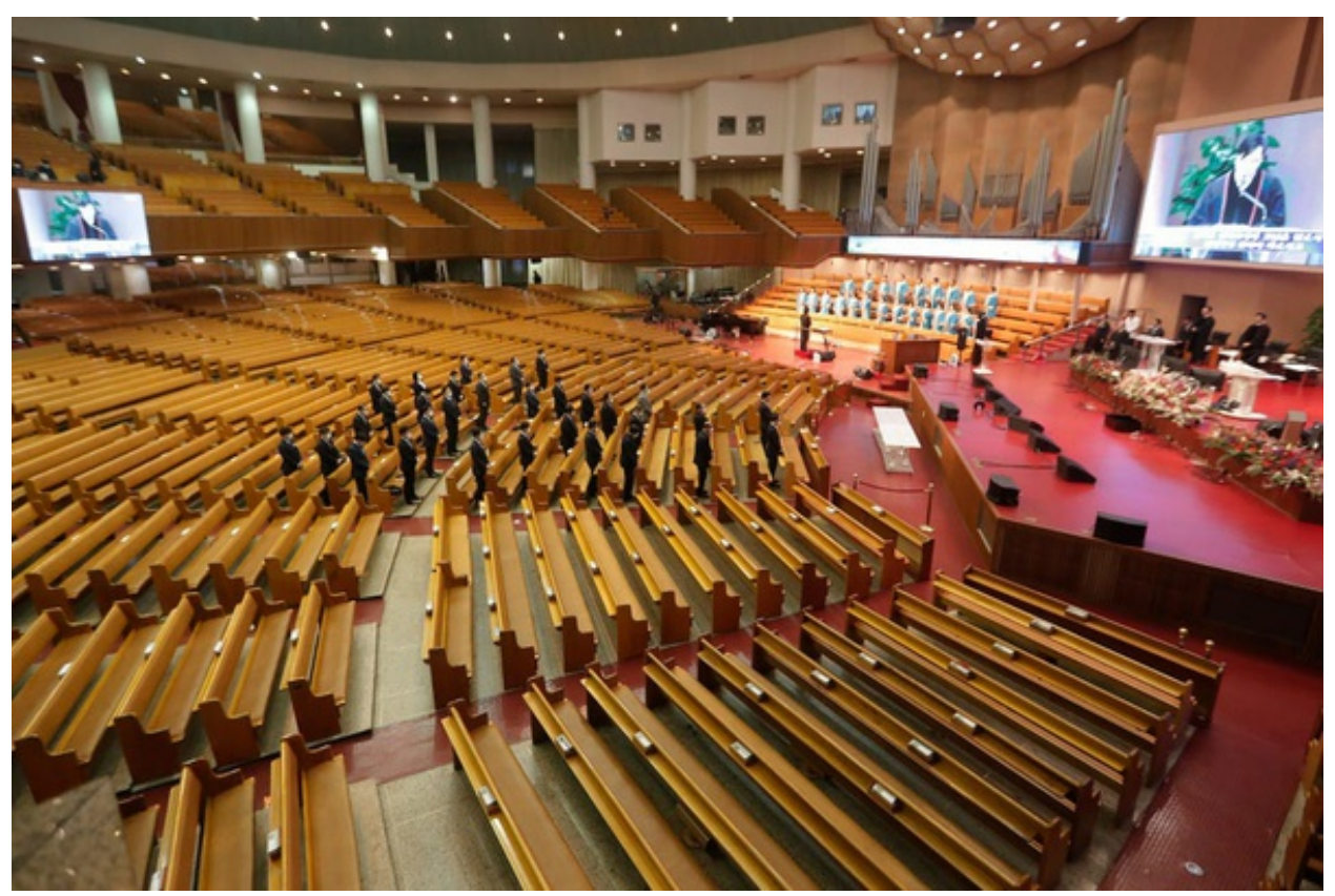
4. The Eiffel Tower before lockdown: