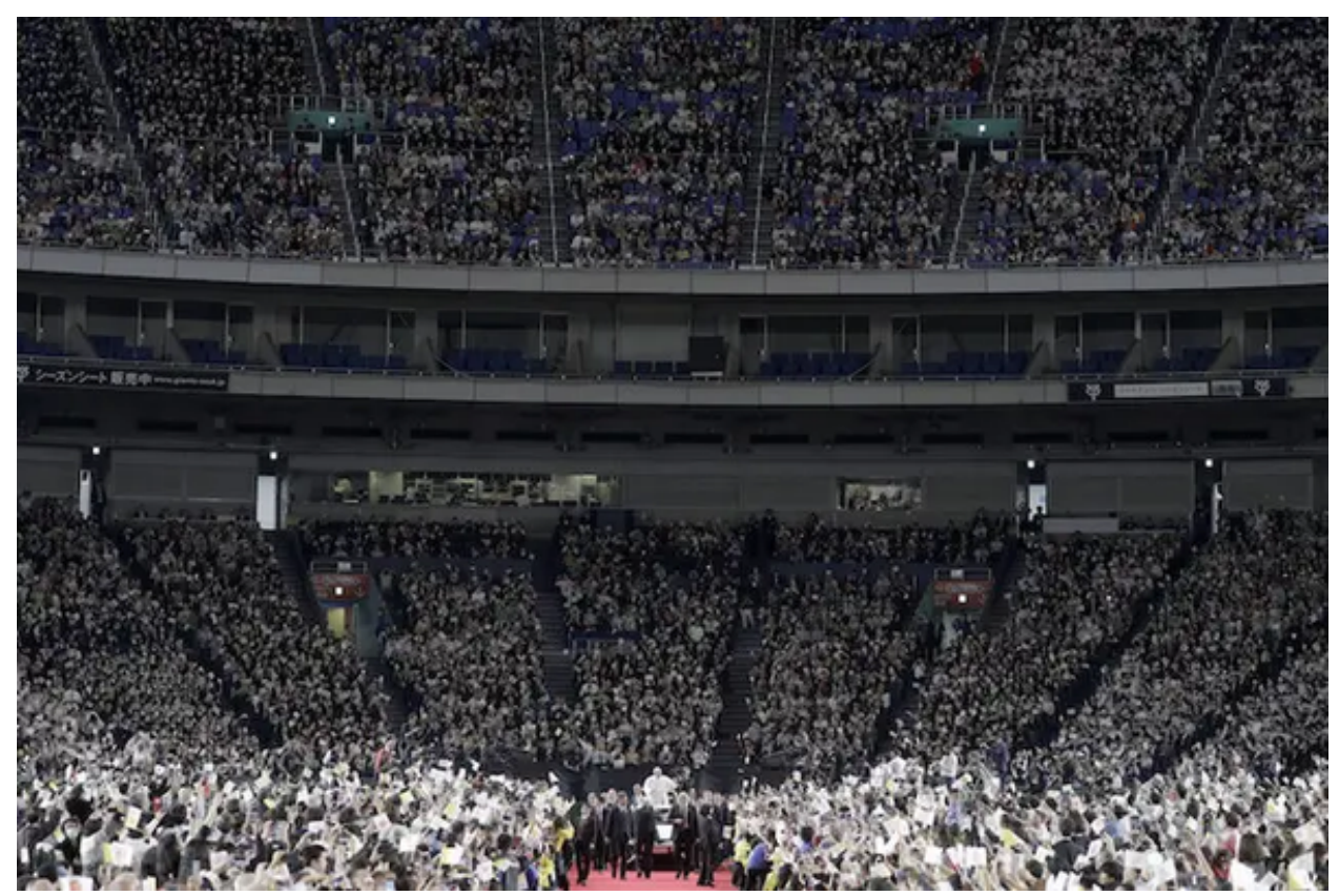
After the lockdown: