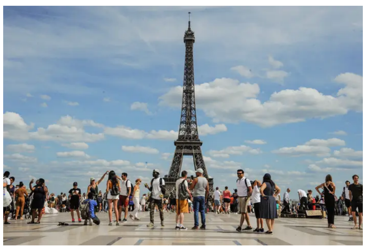
After the Coronavirus lockdown: